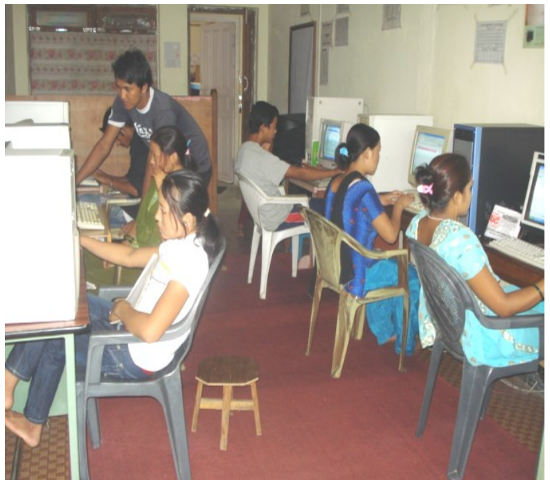
Entrepreneurs, service workers and housewives are among those who benefit from computer training

Apart from wealth-producing benefits, use of computers brings affordable means of communication to family members working away from home, increased access to reading material for pleasure and access to information about health, nutrition and agricultural practices. Giving women the skills necessary to access information easily is a key investment in maximizing the resources of public libraries. Since its inception the training program has created a huge demand for its continuation both locally and across the country. Please contact us (info@nepallibrary.org) if you would like to contribute to furthering this program.