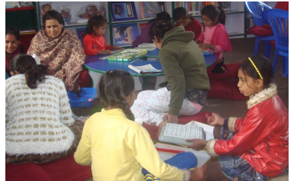
Residents of all ages gather in Biswamitra Library

B iswamitra Community Library is the first public library ever in the village of Dharachaur, Lalitpur District (pop. 9000). The NLF provided financial, training and managerial support.