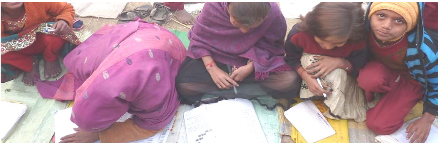
Children hard at work on their studies in Simara

Electrical power arrived in the village of Simara, Sarlahi District, in November 2013. The Subudhi Mahananda Academic Library, established with NLF assistance in 2011, now has seven computers, hundreds of books and access to the e-Pustakalaya.